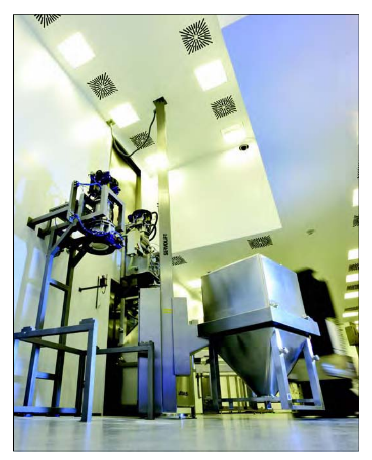
AGV transport to a unit operation.

...the 7,800 sq. m. facility was completed in late 2007 after a construction period of just 25 months."