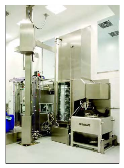
Compression operation (incl. PAT application).

The philosophy of improving and streamlining NEWCON's design also was applied to NEWCON's Commissioning and Qualification (C&Q) approach.