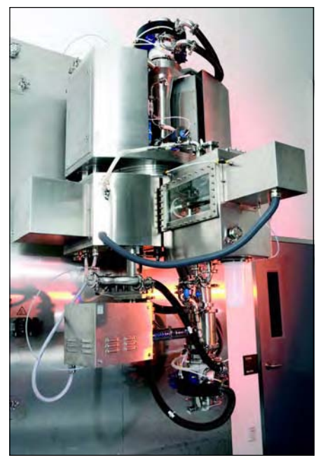
Isolated single pot process with dryer and isolated automated sampler.

The OSD Band 5 area is used for OSD operations handling APIs categorized as Band 5 and includes two processing suites.