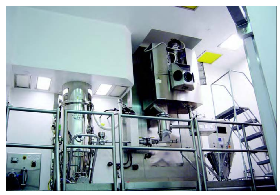
Integrated contained high shear granulator and fluid bed processor.