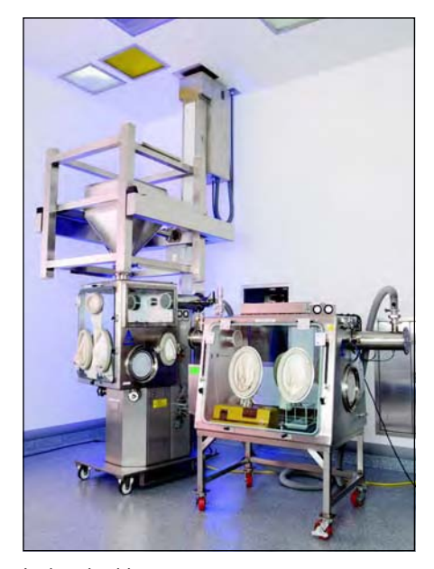
Isolated tablet press.