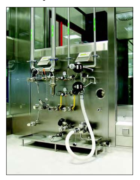
Flexible docking station for utilities and waste water.