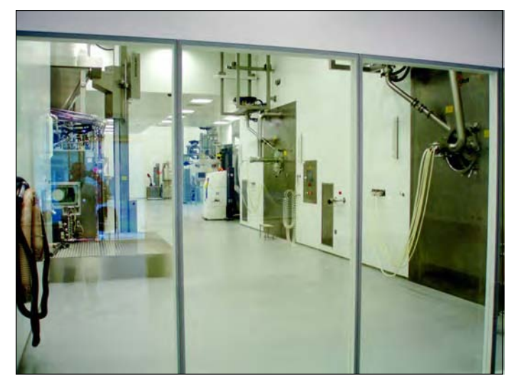
Single containment module.

"Driven by the urgent need for greater production capacity, in 2005, Pfizer Illertissen embarked on the design for the NEWCON project.